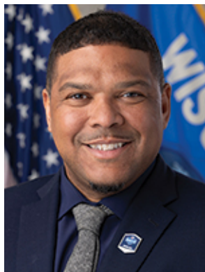
State Representative Amaad Rivera-Wagner

Register for Zoom Link at https://tinyurl.com/WTRA26